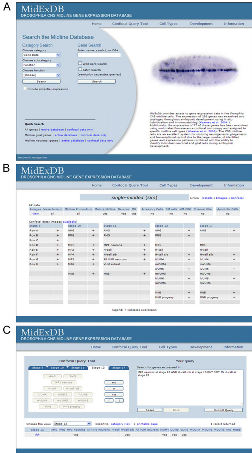
Figure 2 MidExDB search modes. (A) MidExDB Home page showing Category Search, Gene Search, and Quick Search. (B) Results of the Confocal view for the sim gene indicating its expression (+) at 5 stages of development. (C) Results from the Confocal Query Tool. The query is indicated on the right with the results listed below, showing that only the fkh gene matched the query.