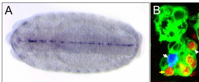
Figure 1 CNS midline gene expression. (A) In situ hybridization (AP histochemistry) of the Poly-glutamine tract binding protein 1 ( PQBP-1 ) gene at stage 15 of embryonic development showing prominent midline cell expression. Ventral view; anterior left. (B) Sagittal view of a single segment of a sim-Gal4 UAS-tau-GFP embryo at stage 17, in which tau-GFP is expressed in all midline cells and facilitates midline cell identification by confocal microscopy. The embryo was immunostained with: (1) anti-GFP (green) to visualize the cytoplasm of all midline cells and (2) anti-Engrailed (red), which stains the nuclei of ventral unpaired median interneurons (iVUMs; yellow arrow points to 1 iVUM), median neuroblast (MNB), and MNB neuronal progeny (arrowhead points to 1 MNB progeny). The embryo was also hybridized to a probe for pale (blue) which stains the H-cell (white arrow). Dorsal top; anterior left.

While Drosophila midline cell gene expression has been studied for over 20 years, a major advance was a large-scale in situ hybridization screen, in which the midline expression patterns of 224 genes were identified and documented throughout embryonic development (Figures 1A) [2]. The genes analyzed were identified based on a variety of approaches, including enhancer trap screens, microarray experiments, the existing scientific literature, and in situ hybridization screens, including midline-expressed genes identified from the Berkeley Drosophila Genome Project (BDGP) embryonic in situ hybridization gene expression database [4]. These data are referred to as "AP data", since the in situ-hybridized embryos were stained using alkaline phosphatase (AP) histochemistry and imaged by differential interference contrast (DIC) microscopy. Subsequently, the expression of 77 genes was mapped at 5 stages of embryonic development using multi-label fluorescence confocal microscopy (Figure 1B) [3,5]. These fluorescent data are referred to as "confocal data". The confocal data provided the ability to: (1) identify individual midline cell types at all stages of embryonic development, (2) analyze how gene expression changes in individual cells during development, and (3) carry-out