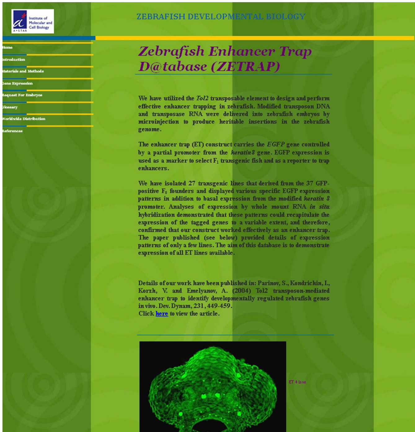
Figure 1 ZETRAP homepage is kept simple for easy navigation.

Here, we introduce a new database of zebrafish transgenic lines, ZETRAP. It contains descriptions of transgenic lines generated using an enhancer trap system with modified Tol2 transposon from medaka [10]. In that article, only a handful of ET lines were described in sufficient detail. Other lines were presented rather superficially and the