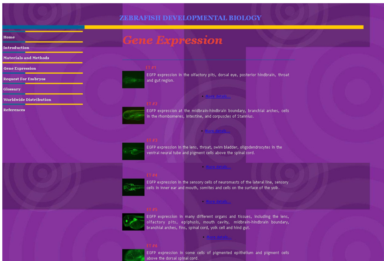
Figure 2 The Gene Expression view lists all ET lines and provides their brief description.

ET lines contains many other interesting lines that could also be very useful for researchers within the community. In line with such observation, we have made an effort to describe their GFP expression patterns in detail and in addition, provide other information of all published ET lines in a convenient format of an online database.